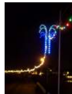
22 new fountains installed